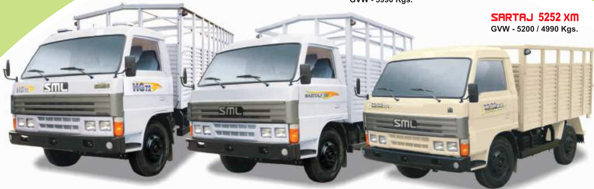
SARTAJ 5252 XM GVW - 5200 / 4990 Kgs.