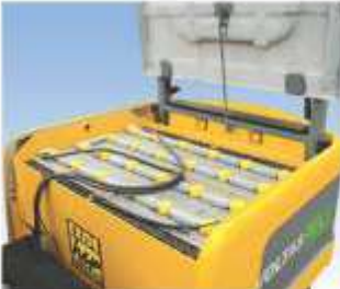
48V battery & AC traction for longer hours of operation