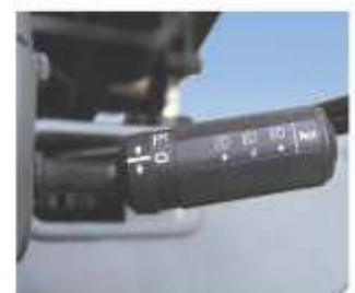
Easy access combination switch