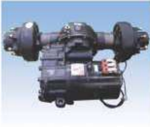
Powerful, energy efficient drive line