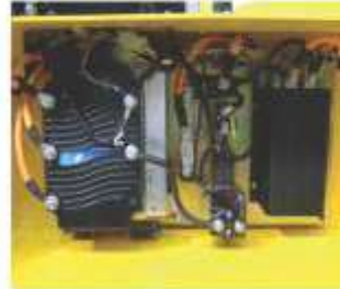
Side mounted controller for easy maintenance