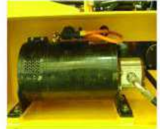
Side mounted hoist motor for easy maintenance