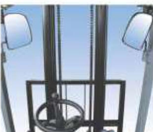
Wide view mast for clear front operator visibility