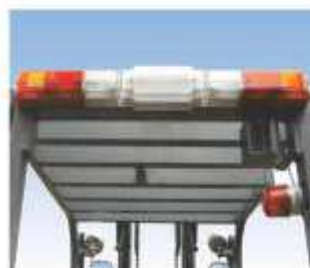
High Mounted Rear Combination and Beacon Lights.