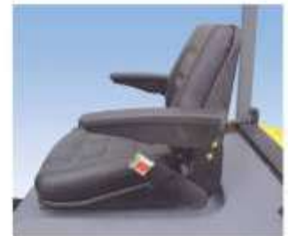
Deluxe adjustable seat with Arm rest & seat belt for operator safety