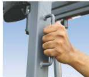
Large operator hand assisted access grip