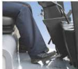
Ample leg room for operator comfort