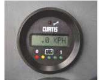
Elegant Instrument Panel with on board diagnostics