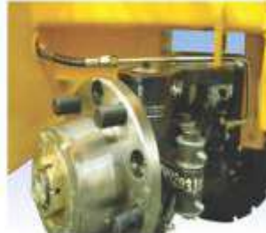
Heavy duty steer axle for rugged operations