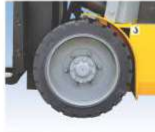
Large front tyres for enhanced road grip and stability