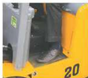
Wider Operator foot rest for safer entry and exit