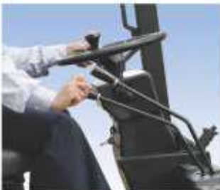
Ergonomically located levers for ease in operation