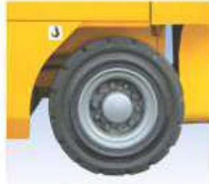
Minimum rear overhang for less turning radius