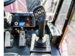
11 Button Command Joystick (Standard)