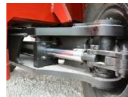
Industry's Toughest Steer Axle (Standard)