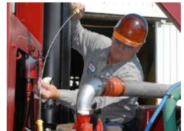
Easily Accessible Daily Checks