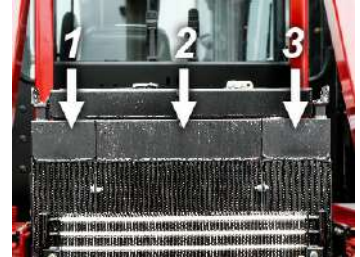
3-Section Bolted Radiator (Each section can be serviced separately)