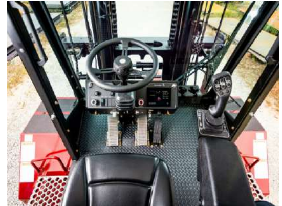
Fully Enclosed 2-Door Cab with Multiple Climate Control Configurations Available (featured cab is shown with available options)