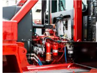
Easy Access to Drive Train & Hydraulics