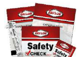
Safety Check Vehicle Information Package (Standard)