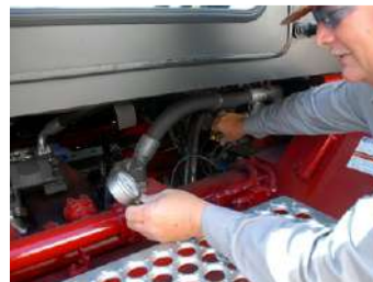
Service & Inspection from Ground Level