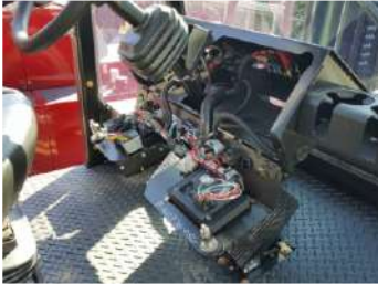
Flip-down Dash with Color/Number Coded Wiring (Standard)

Taylor Lift Trucks are designed with ease of maintenance and serviceability as a key priority. With today's engine and emissions requirements, daily maintenance checks and timely periodic service are the key to your equipment's longevity. All daily checks across the Taylor product line can be accessed from the ground or running board, ensuring that operators can complete these requirements with ease. Also, the sliding hood (on rollers), side service doors and removable floor panels open to expose the drive train and hydraulics to provide easy access for service and inspection.