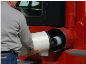
Donaldson Air Cleaner with Safety Element (Standard)