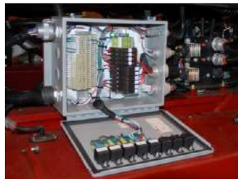
Heavy Duty Circuit Breakers/Reset Switches (Standard)