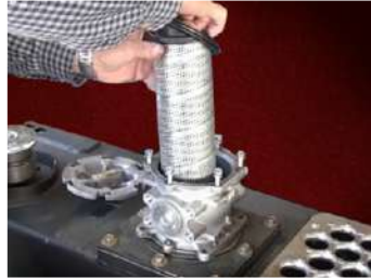
Spin-on Breather, Wire Mesh Strainer & Replaceable Internal Element (Standard)