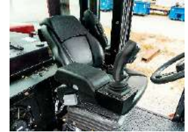
Fully Adjustable Mechanical Seat (Standard)