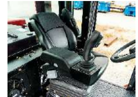
Fully Adjustable Mechanical Seat (Standard)