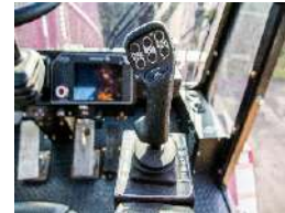
11 Button Command Joystick (Standard)