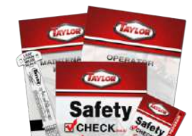
Vehicle Information Package (Standard)